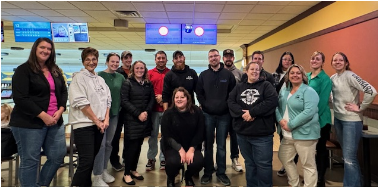
Membership and Young Professionals Councils gathered on February 6th for an icebreaker outing and planning meeting for our first quarter General Membership Meeting taking place on March 12th at Janesville Elk's Lodge.

“Success is best when it's shared.” Howard Schultz